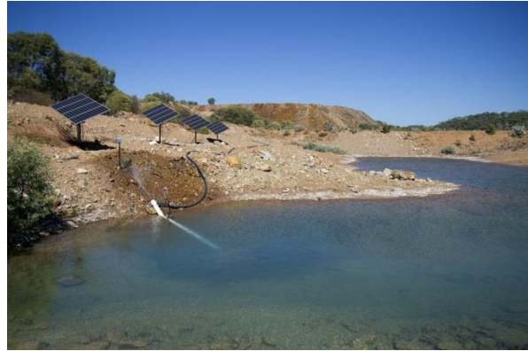
Acidic drainage (pH ~3.5) line from the closed Tabletop gold mine, Croydon goldfield, QLD (July 2011; note solar panels for pumps and pipe/valve leak)