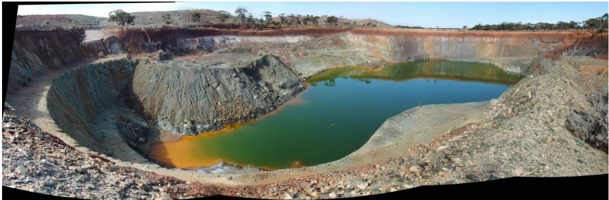
Visual evidence of acidic water in the Transvaal open cut, Southern Cross goldfield, WA (July 2013)