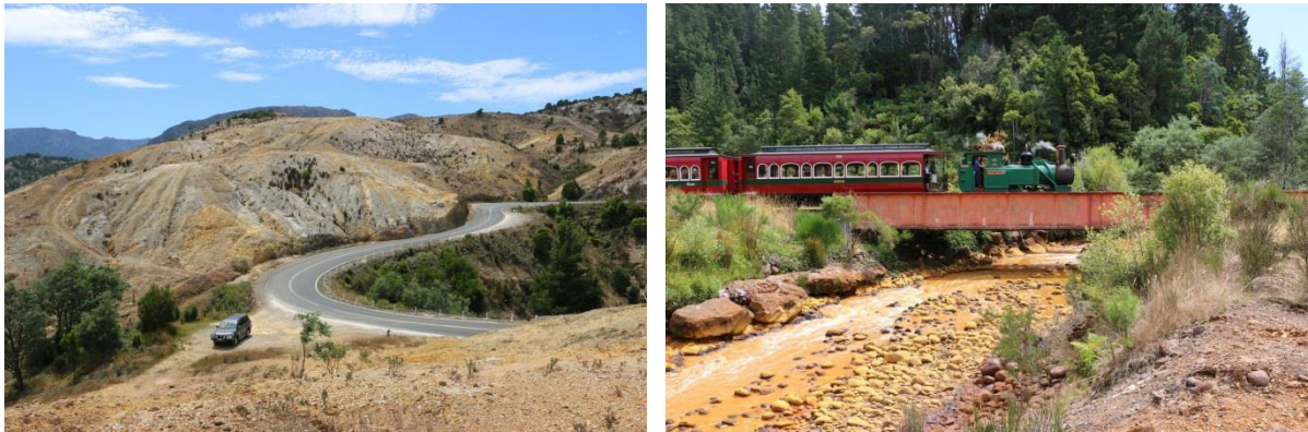
Fig 4. Extensive environmental impacts from more than a century of Cu mining in the Mt Lyell field, western Tasmania: bare hills surrounding Queenstown, largely due to emissions from historic smelting (left); train over the Queen River, severely polluted by ongoing AMD and historic riverine disposal of mine waste (right) (all photo's MPI; February 2014)

the shores of Macquarie Harbour. Numerous subsequent studies have followed – but rather than move towards remediation, recently the Tasmanian Government has issued a tender for the commercial mining of the source of the AMD at Mt Lyell, a move that is likely to result in more delays. The current estimated liability to clean up the site is $16 million, which will undoubtedly prove to be a significant underestimate if rehabilitation ever begins. Some site photographs are shown in Figure 4.