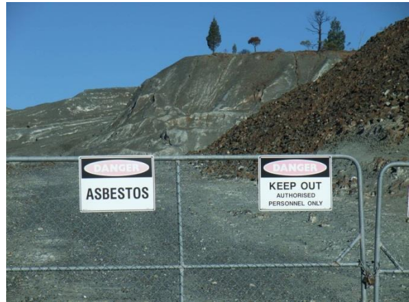
Unrehabilitated asbestos tailings pile on exposed ridge, Woodsreef mine, NSW (July 2012)