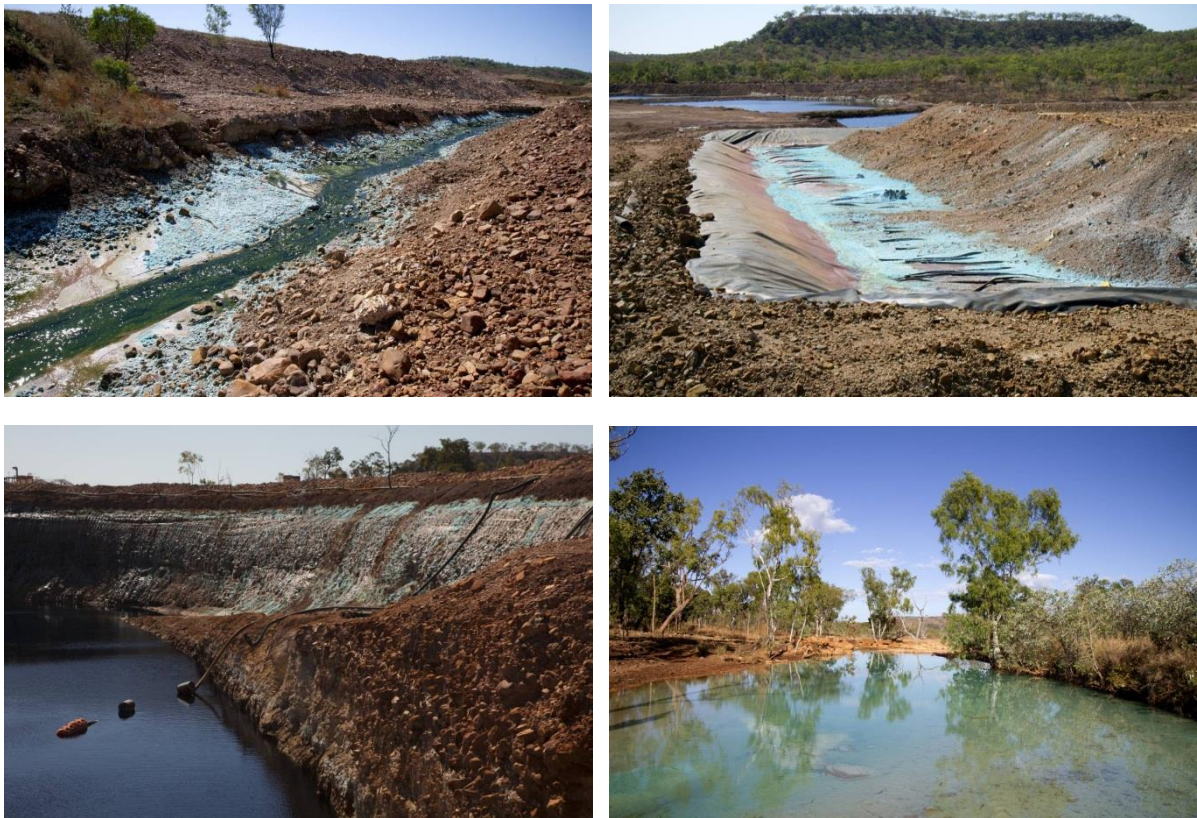
Fig 3. Severe acid and metalliferous drainage (AMD) problems at the former Redbank copper mine, Wollogorang region, NT: AMD seeping out from waste rock (top left); small HDPE-lined pad for the trial heap leach in 2006 (top right); AMD flowing through the water table and into the Sandy Flat open cut (bottom left); biologically dead Hanrahan's Creek, adjacent to Redbank (bottom right)

The site remains unrehabilitated, nor have there been attempts to remediate the source of AMD and ongoing pollution. In August 2005 Burdekin Pacific Ltd took over as owner and operator, and changed name to Redbank Mines Ltd (now just Redbank Copper Ltd, RC), and sought to develop the site into a commercial mine. RC is a junior exploration company and are not in a financial position to remediate the site and appear to be struggling to secure the required capital to develop the mine given recent market conditions. Future mining at the site has been heralded as way to remediate the site but 5 years after releasing an EIS the company says they are still 'exploring'. The NT Government is now committed to using the Mining Remediation Fund to assist in the clean-up of Redbank and the Mines Minister has commented that this site is a priority. The extent of the impacts and the marginal economics of the project may prevent any attempt to restart the mine with liability then transferring the NT Government.