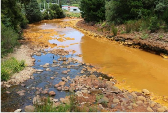
King River, effectively biologically dead due to more than a century of AMD and other mining impacts from Mt Lyell, in Queenstown, TAS (Feb. 2014)

discharge that will last “for many hundreds of years” (p 65) if left untreated. Examples of AMD impacts and other legacy mines are shown in Figure 2.