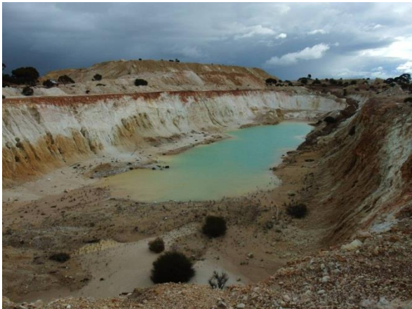
Lack of rehabilitation, Black Prince mine, Forrestania region, WA (July 2013)